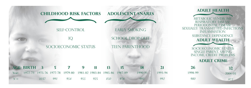
Fig. 1. Design of the Dunedin Multidisciplinary Health and Development Study.

well children's self-control, as it is distributed in the population, predicts real-world outcomes after children reach adulthood. We examined adult health outcomes, such as substance dependence, inflammation, and metabolic abnormalities (e.g., overweight, hypertension, cholesterol), because these are known early-warning signs for costly age-related diseases and premature mortality. We examined wealth outcomes, such as low income, single-parent child rearing, credit problems, and poor saving habits, because these are early warning signs for late-life poverty and financial dependence. We also examined convictions for crime, because crime control poses major costs to government.